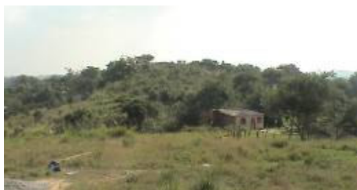
Site Photo of Recreation Area and Childrens' Homes area on hill beyond

Land for the Children's Village has already been donated in two parcels by the mayor's office of Sao Goncalo. The main parcel is 7 acres and will include the Phase I facilities. The other parcel is 5 acres a short block away, and includes an orchard where the children will learn how to care for the land.