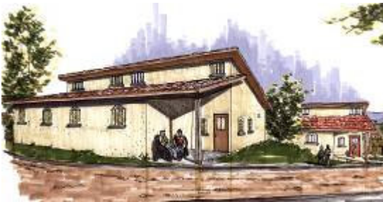
Front of Children's Home

A home is more significant than just a house where you stay; it is a cohesive unit that is formed when a family lives together. In each home, a Christian Brazilian husband and wife will become Mom and Dad for 8 to 10 street children. These families will study, play, work, laugh, cry, pray and grow together.