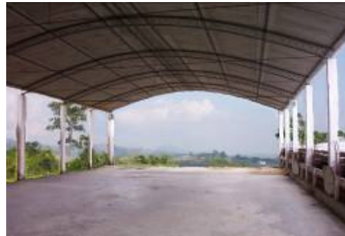
Digital Rendering of Sports Court

Children need to develop their body as well as their spirit. The covered sports court will be used for weekly children's Bible studies and recreational games. During Phase I, the sports court will also serve as the chapel for the Village and surrounding community.