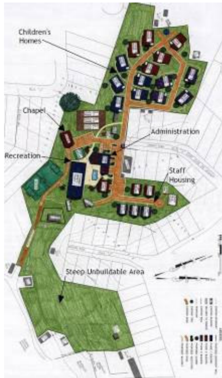
Masterplan of Main Parcel (Phase I Facilities in Blue)

Land for the Children's Village has already been donated in two parcels by the mayor's office of Sao Goncalo. The main parcel is 7 acres and will include the Phase I facilities. The other parcel is 5 acres a short block away, and includes an orchard where the children will learn how to care for the land.